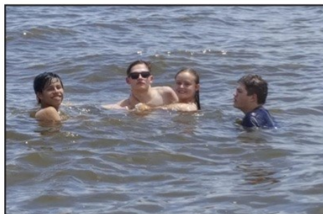
Swimming in the Gulf of Mexico