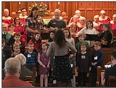
PRACTICING AND THEN SINGING IN CHURCH