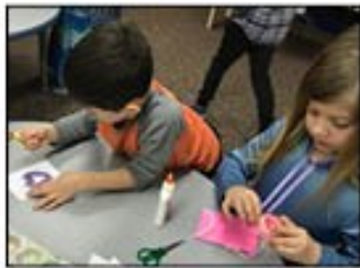
DURING THE ANNUAL MEETING CHILDREN MADE VALENTINES FOR SHUT INS.