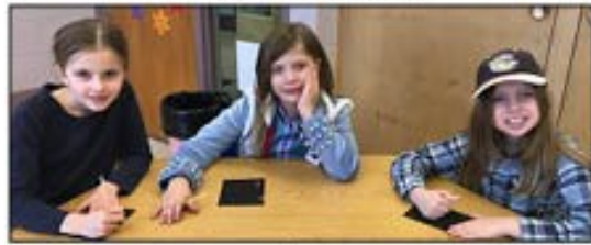
1ST - 4TH GRADERS MADE STAINED GLASS