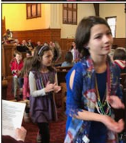
MARCHING AROUND THE SANCTUARY TO THE MUSIC OF THE MAD MONKS