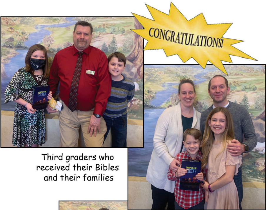
Third graders who received their Bibles and their families