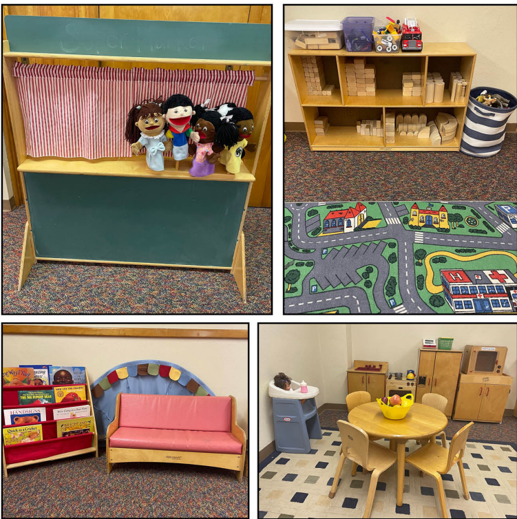
Sneak peek photos of our refreshed nursery space

Sneak peek photos of our reimagined "Kids'Zone" church school classroom with new educational toys and equipment inherited from the former New England Preschool