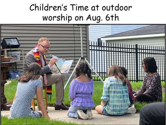
Children's Time at outdoor worship on Aug. 6th

Sneak peek photos of our reimagined "Kids'Zone" church school classroom with new educational toys and equipment inherited from the former New England Preschool