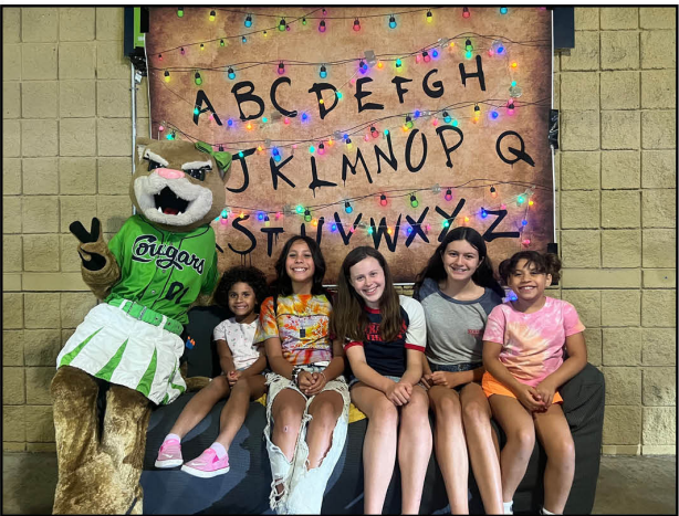
At the Kane County Cougars game with New England Church on Aug. 4th