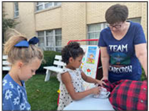
There were scarecrows to make!